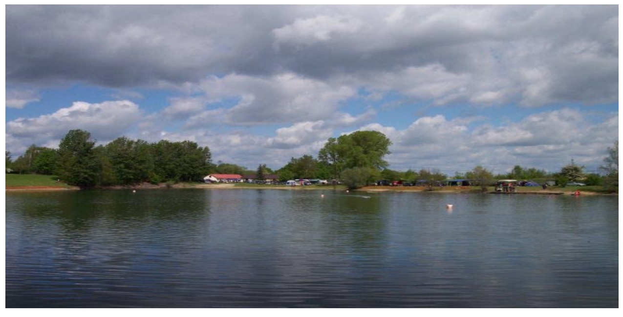
19th World Championship Naviga in the FSR classes V / H / O In the European City

The German Nauticus e.V. has the pleasure to invite the best modelboatdrivers of the World